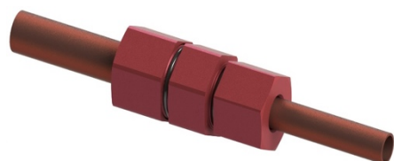
Union Reducer (UNRD)