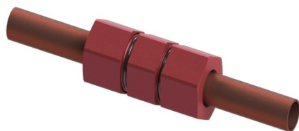
Union Straight (UNST)